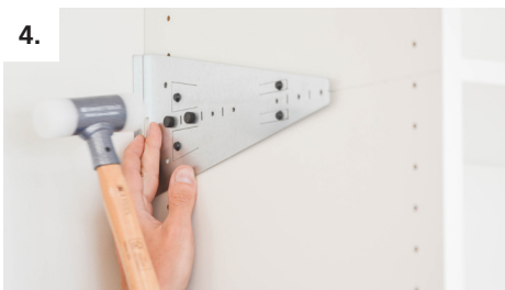
4. Place the marking jig on the rear edge of the panel and mark the drilling centres