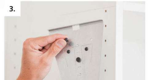
3. Screw in the marking tip onto the back side of the marking gauge