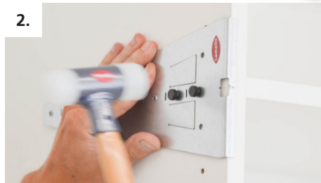
2. Place the marking jig on the front edge and mark the drilling centres