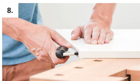
8. Install Divario P-18 into the sides and the shelf