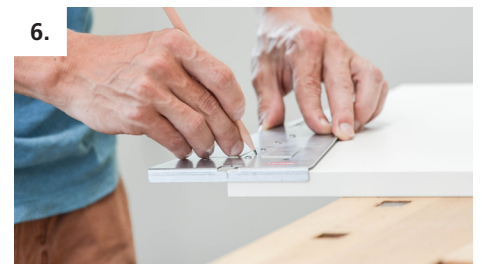
6. Mark the centre of the connector on the shelf