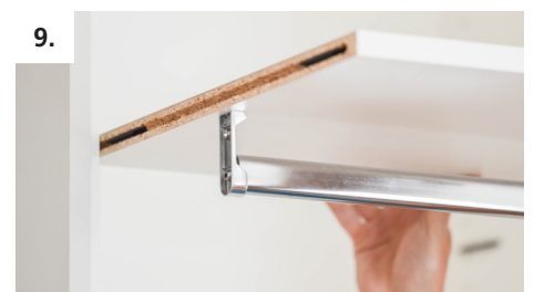
9. Slide the shelf in – and you're done!