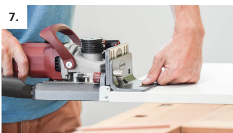
7. Cut longitudinal and P-system grooves in the shelf